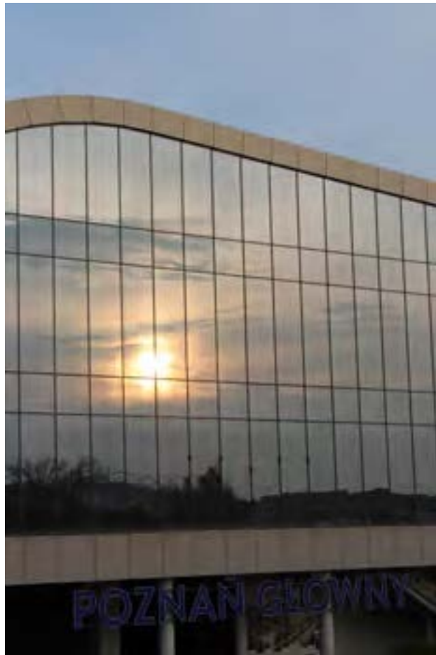
The Larger Poznań Metropolitan Area (PMA) numbers 1.4 million inhabitants and extends to a satellite town, making it the fourth largest such population nucleus in Poland.