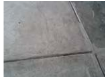
1. Sealing joints – Sikaflex®- 11 FC 2. Repairing cracks – Sikadur® and Sika Rep®

> tribute to this worthy cause, donating the prize for the team ranking third. Held on Wednesday, 22 October, the competition consisted of laying about 200 m 2 of ceramic tiles in the school's 4 classrooms.