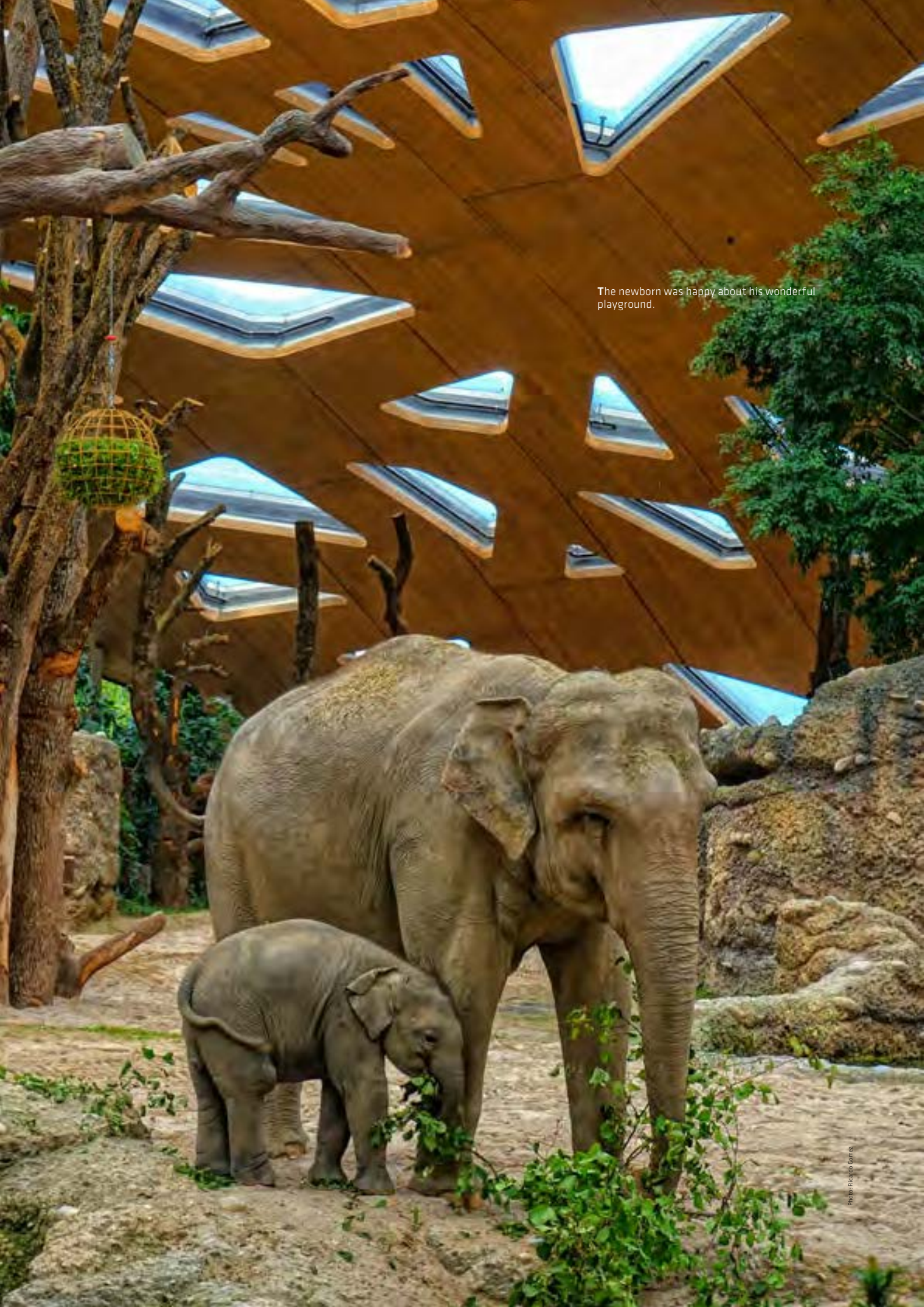
The newborn was happy about his wonderful playground.