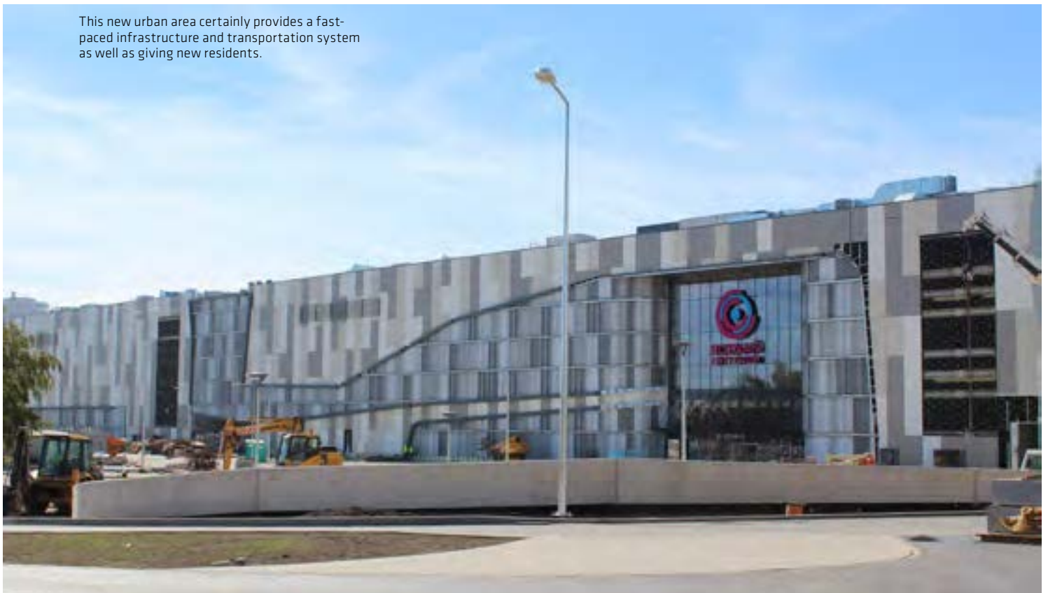
This new urban area certainly provides a fast-paced infrastructure and transportation system as well as giving new residents.