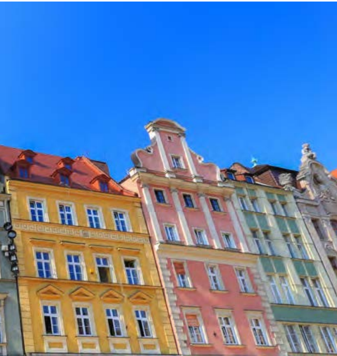
The old city center is charming and traditional at the same time.