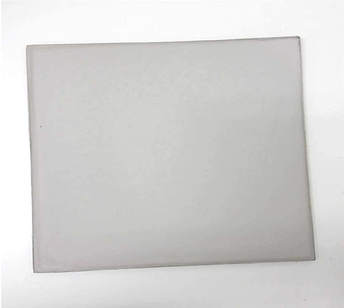
Specimen for the chemical emission