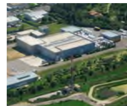
CONSTRUCTION OF A SOLAR PARK, SIKA FRANCE SA PLANT MARGUERITTES, FRANCE

The installation of energy efficient interior and exterior lighting led to electricity savings of 979,000 kWh per year. Annual CO 2 emissions of 612 tons were avoided. The project was eligible for a New Jersey State incentive to encourage companies to install energy efficient luminaires.