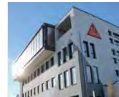
DGNB®-CERTIFIED SIKA TRAINING CENTER, SIKA GERMANY GMBH PLANT STUTT GART, GERMANY

Standard coal was replaced by rice husks to fire powder dryers and to reduce the factory's CO 2 emissions. The replacement of around 1,500 tons of coal annually led to an emission reduction of 3,695 tons CO 2 per year. The silica-rich ashes are used as raw material in admixtures to substitute silica fume.