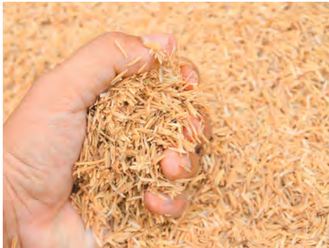
RICE HUSKS AS COAL REPLACEMENT IN STEAM BOILERS, JIANGSU SIKA TMS ADMIXTURE CO. LTD. PLANT NANJING, CHINA

Find more about energy www.sika.com/sustainability