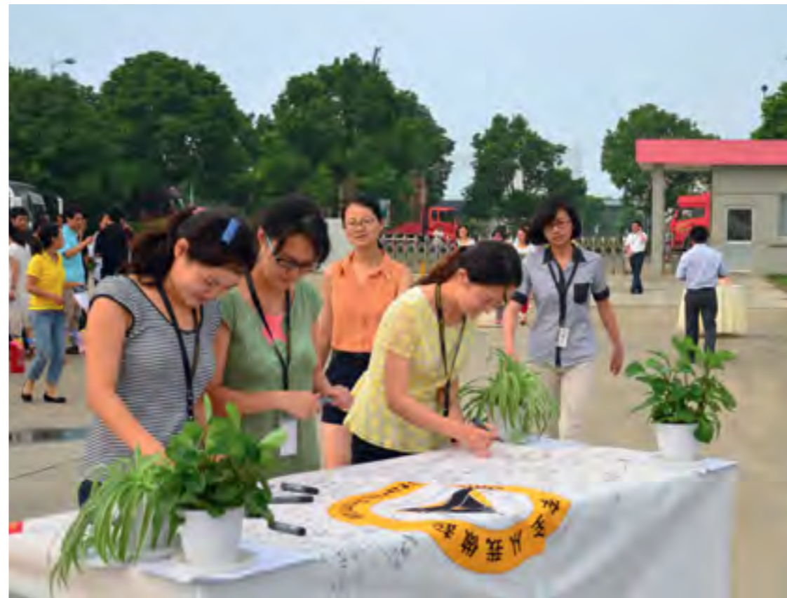
SAFETY AWARENESS WEEK, SIKA ASIA/PACIFIC 38 PLANTS IN 13 COUNTRIES, ASIA/PACIFIC

BY ACCIDENTS DUE TO SAFETY AWARENESS PROGRAM